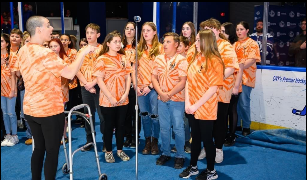
Below: 7th and 8th grade chorus sings the National Anthem