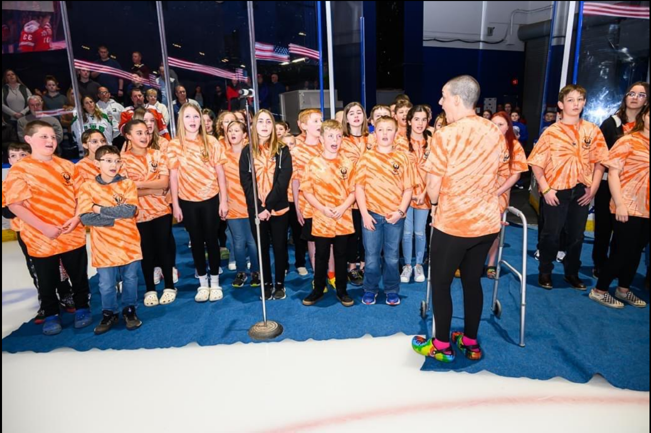
Above: 5th and 6th grade chorus sings God Bless America