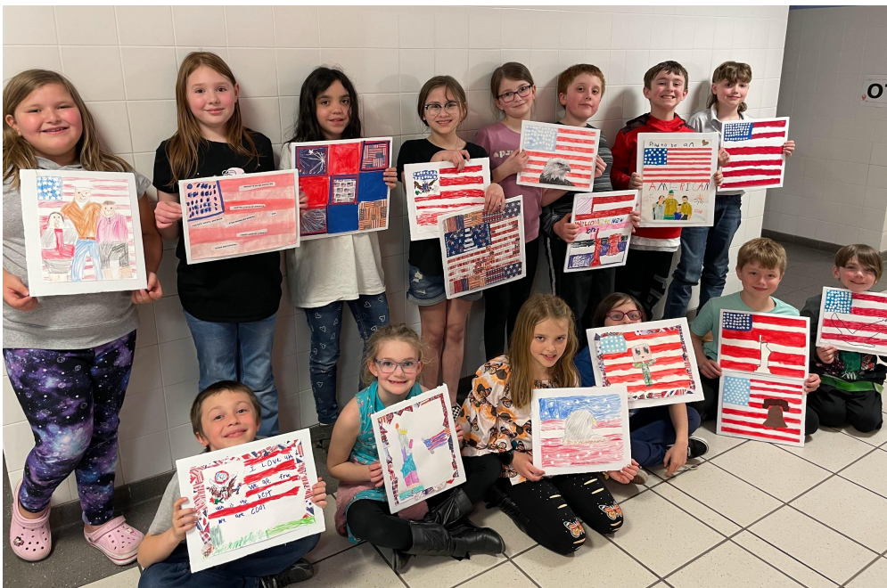
The students and their entries for the Illustrating America contest